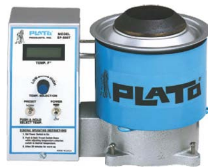
SP - 150T