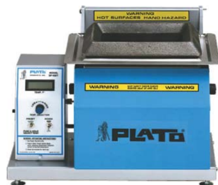
SP - 750T

Specifications and Modification Can be done without period notice