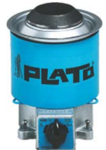
SP-201 & SP-401

Plato's General Purpose Solder Pots control temperature \pm 6^{\circ}\text{C} through the use of a thermal timer switch with automatic correction for voltage fluctuations. A three index position control switch with infinitely variable temperature control. Safety heat shield. Removable dross tray for easy cleaning. Three-wire, grounded UL listed cord. 2.5" (64mm) diameter by 1.5" (38mm) deep crucible. Adjustable leveling feet. All metal construction for ESD protection